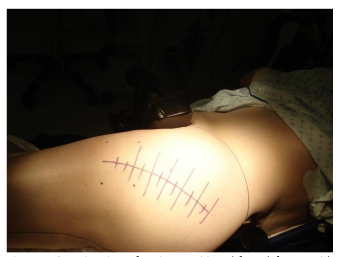
Figure 1: Superior view of patient positioned for a left THR with the Stulberg Hip Positioner and skin incision being marked

position on the operating table with the operative side up. A variety of hip positioning devices are available to use. I use the Stulberg Hip Positioner [7]. The aim is to position the patient perpendicular to the table using the sacrum as a guide. The positioner is attached to the table using existing table adapters. The pads are attached to modular upright posts utilising a single pad on the sacrum and double pads anteriorly to both anterior superior iliac spines (Figure 1). The posts are radiolucent and therefore facilitate radiographs on table should it be required. The torso may be stabilised with further supports if required to prevent tilt of the patient. The bony prominences are padded and protected.