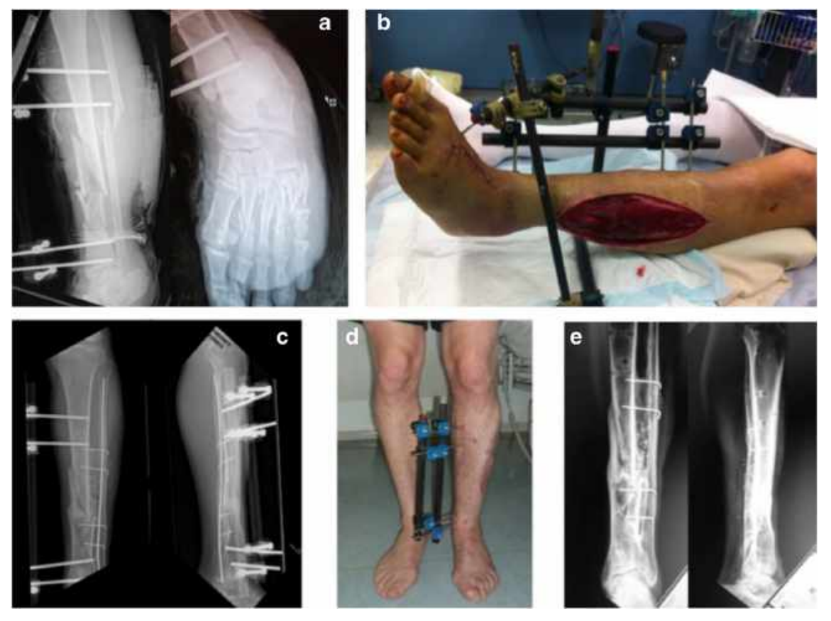
Fig. 3 Case report no. 1. Patient repatriated from Mali, suffering from a compartment syndrome after a leg closed fracture following an IED injury and forefoot closed fractures. a , b DCO procedure done at role 2: external fixation and fasciotomy. c , d External fixation modification and

IED injury mechanism and persistence of wound contamination after the second debridement were risk factors of amputation failure (Table 5).