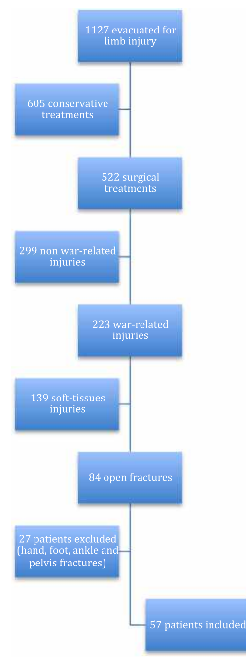
Fig. 2 Flow chart

The data were collected using Excel (Microsoft® Office 2010). StataIC® 15.1 (STATACORP LLC) software was used for contingency table analysis. Potential risk factors for therapeutic failure were examined through univariable logistic regression model. Odds Ratios with their interval with a 95% confidence were calculated for each risk factor of failure studied. Risk factors with an overall p value < 0.05 were retained.